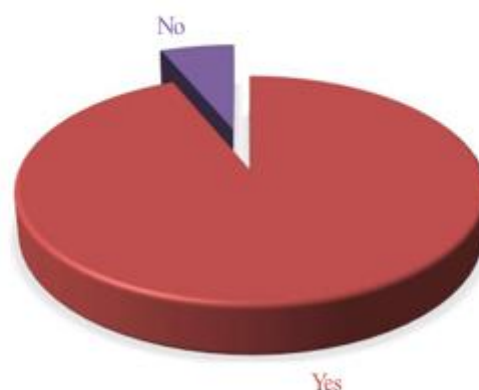
Figure 6.1: Awareness among the people on Holistic teaching.

HAVE YOU HEARD THE CONCEPT OF HOLISTIC TEACHING BEFORE?